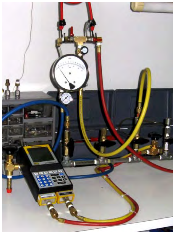
A backflow kit being certified in BBI's state of the art calibration lab